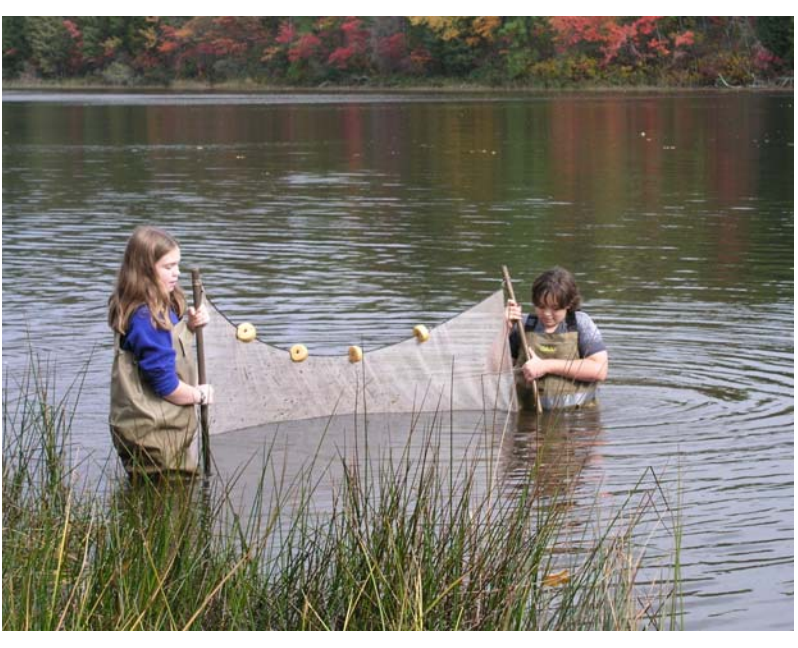
More than 180 students and teachers participated in the Commission's annual World Water Monitoring Day Event. Students above use a net to survey for native Pinelands fish.