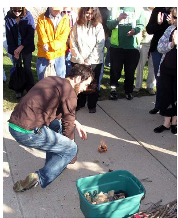
Participants learned how to make fire during a Pinelands Survival course offered during the 21st annual Pinelands Short Course. The event drew a record crowd of more than 800 people.