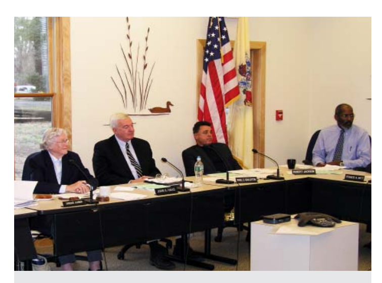
The Commission adopted three sets of amendments to the Pinelands Comprehensive Management Plan in 2010, and made significant progress in finalizing a proposed amendment aimed at ensuring the environmentally-appropriate siting of solar energy facilities in the Pinelands.

In 2010, the Pinelands Commission adopted three sets of amendments to the Pinelands Comprehensive Management Plan (CMP), the rules that govern land-use, development and natural resource protection in the million-acre Pinelands Area. The amendments are as follows: