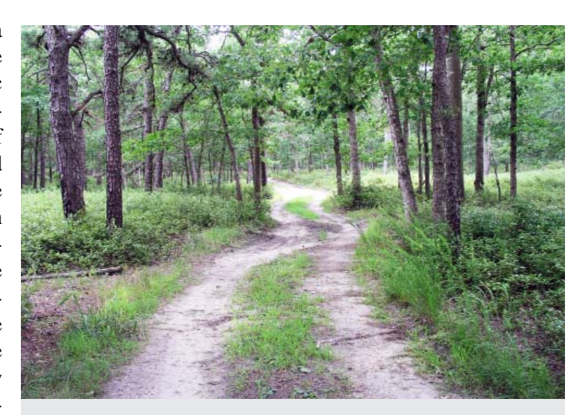
The property above is among the forested areas that will be permanently preserved under the Richard Stockton College's new Master Plan, which the Pinelands Commission approved in 2010.

In September 2010, the Commission approved a new master plan for the Richard Stockton College of New Jersey in Galloway Township, Atlantic County. The Plan sets forth a comprehensive blueprint for the future development and expansion of the College's campus in recognition of increased enrollment and projections of future growth. The Plan permanently protects 1,257 acres of land on and near the college's campus, including 170 previously developable acres. It also increases the size of the College's development area by approximately 450 acres and the amount of developable land by 151 acres. The College also agreed to use low-impact design and construction principles by minimizing disturbance of forested areas, clustering development away from wetlands and deed restricted areas, and minimizing turf.