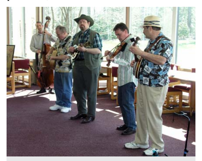
The Bad Dogz were among the live bands who provided musical entertainment during the 21st annual Pinelands Short Course.

The Pinelands Short Course is sponsored by the Commission, the Pinelands Institute for Environmental Studies (or P.I.N.E.S.) and Burlington County College, which has hosted the event at its Pemberton Township campus since 2004. The event is registered with the New Jersey Department of Education, and professional development credits are available to New Jersey teachers who attend.